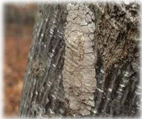
SLF Egg Masses (Sept. to April)

For more information, google NJ Department of Agriculture, Spotted Lanternfly and Penn State Extension, Spotted Lanternfly Management for Residents .