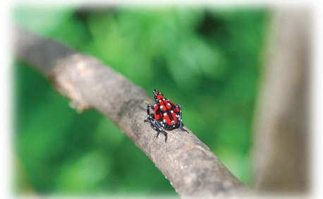
SLF Nymph Stage (April to Sept.)